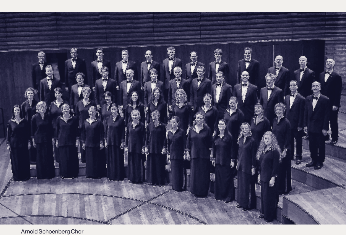
Arnold Schoenberg Chor