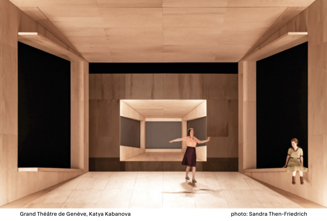
Grand Théâtre de Genève, Katya Kabanova