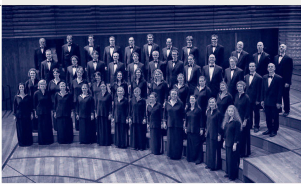
Arnold Schoenberg Chor