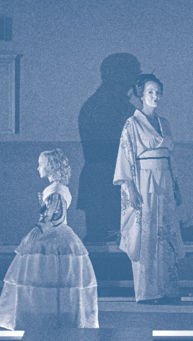
The Makropulos Affair Staatsoper Unter den Linden, Berlin